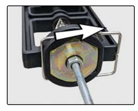
3) Secure the tube in the hex cavity by sliding the lock spring to the closed position.