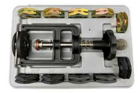
The Surseat P-51B comes with 37° and 45° lapping heads as well as 10 collets for 3/16" to 1/2" tubing.