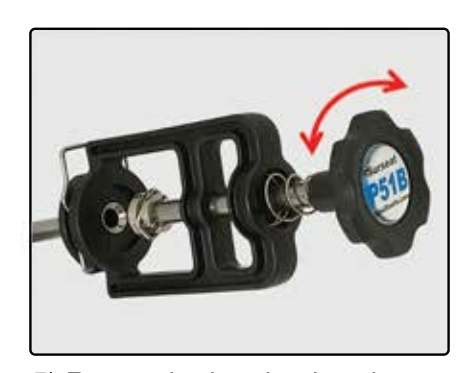
5) Rotate the lapping head back and forth until a clean seat is formed. More is not better.