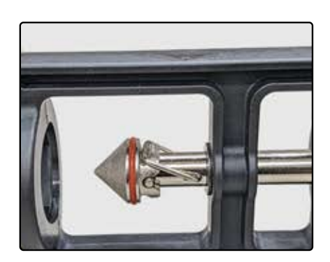
1) Install the lapping heads by pushing them onto the clip. To remove them, lift the clip.