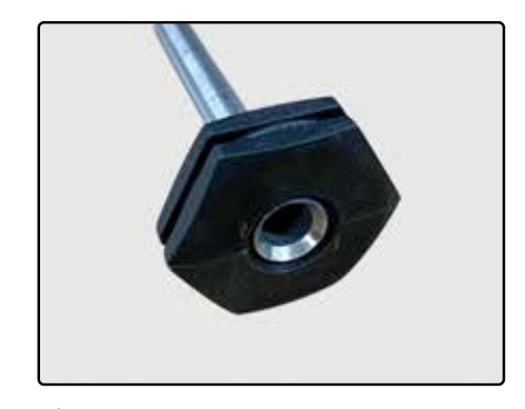
2) Insert the tube into the appropriate clamping or threaded collet size.